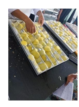
Jackfruit Chips processing